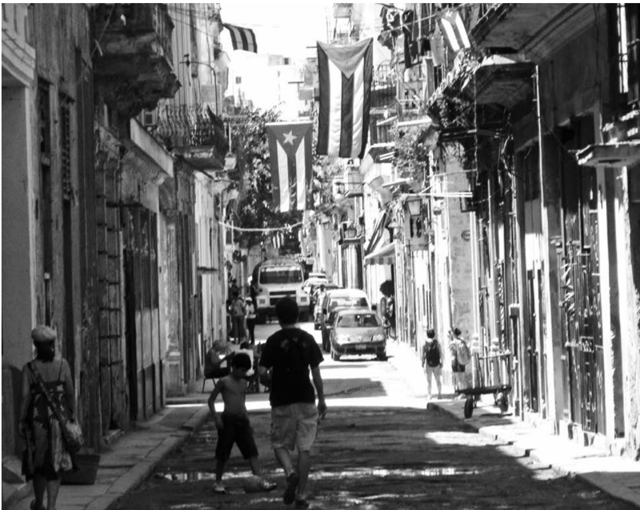
Life on the Street

This article was originally published on the website Foreign Policy