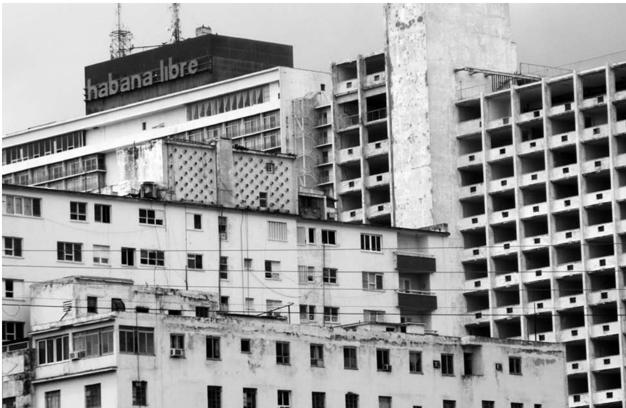
Habana Libre 2010