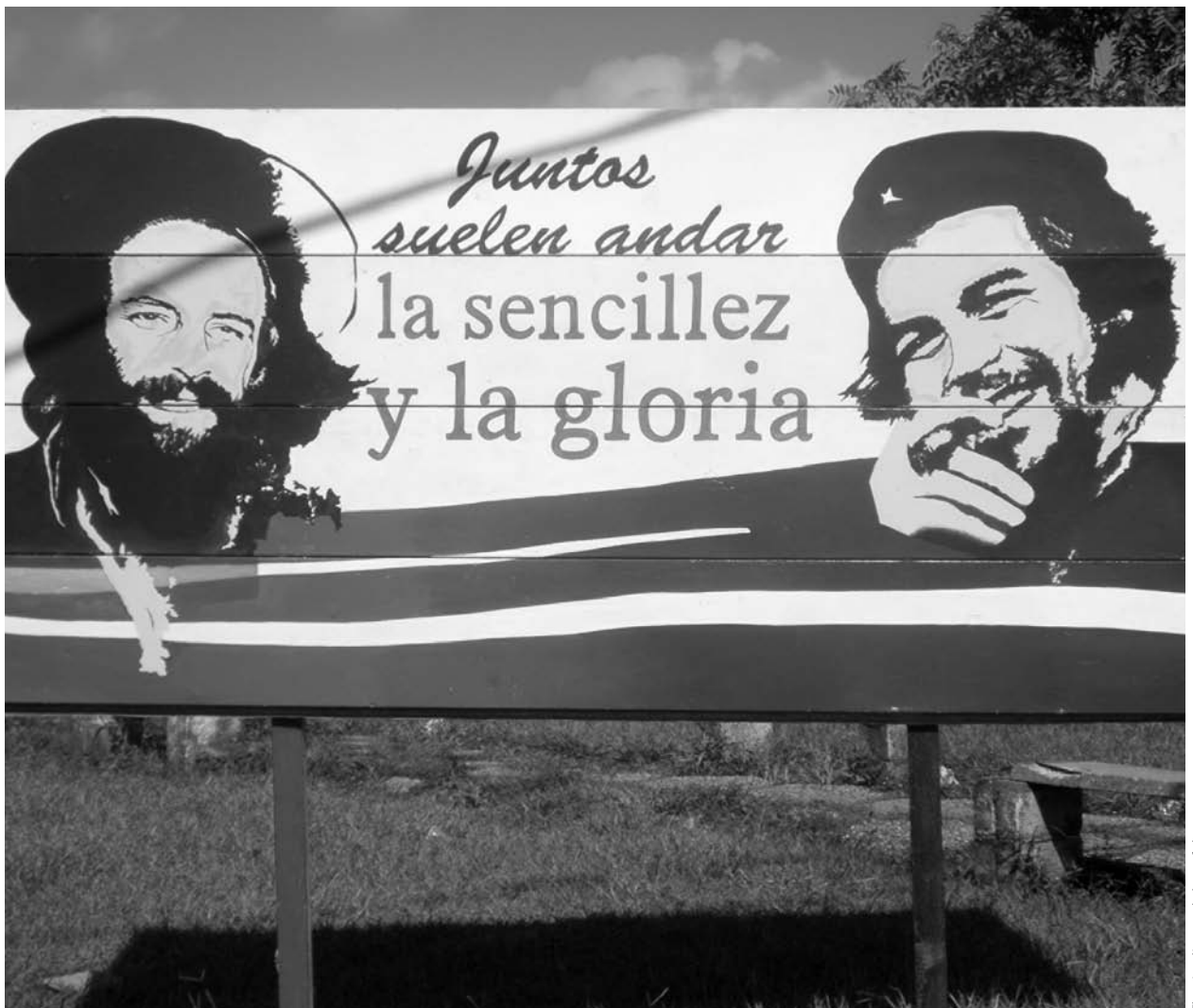
The simplicity and glory of the past