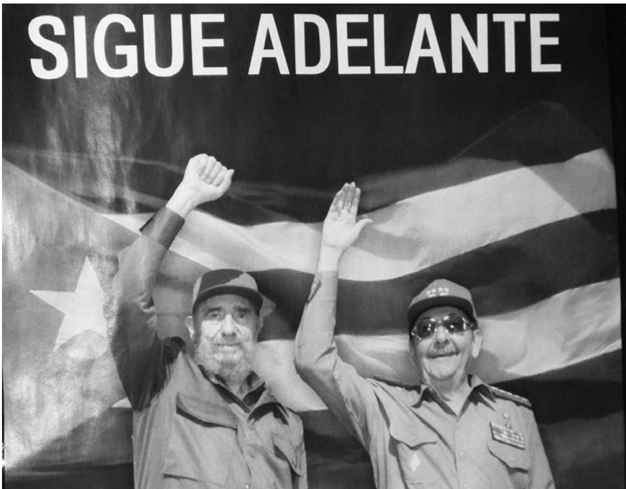
Delusions of grandeur

what they are doing. And on top of this, most are forced to deal with the conditions in Cuban prisons that are appalling. Earlier this year when renowned dissident Orlando Zapata Tamayo went on strike exactly because of the conditions of these corrective institutions, built on “the island of freedom”, in which political prisoners are held. His personal courage to stand up to the regime was so strong that he was not afraid to die and thus to demonstrate the determination of the third group to fight the Cuban regime to the full extent, putting in danger the only thing that left for them “in the socialistic paradise”: their own lives.